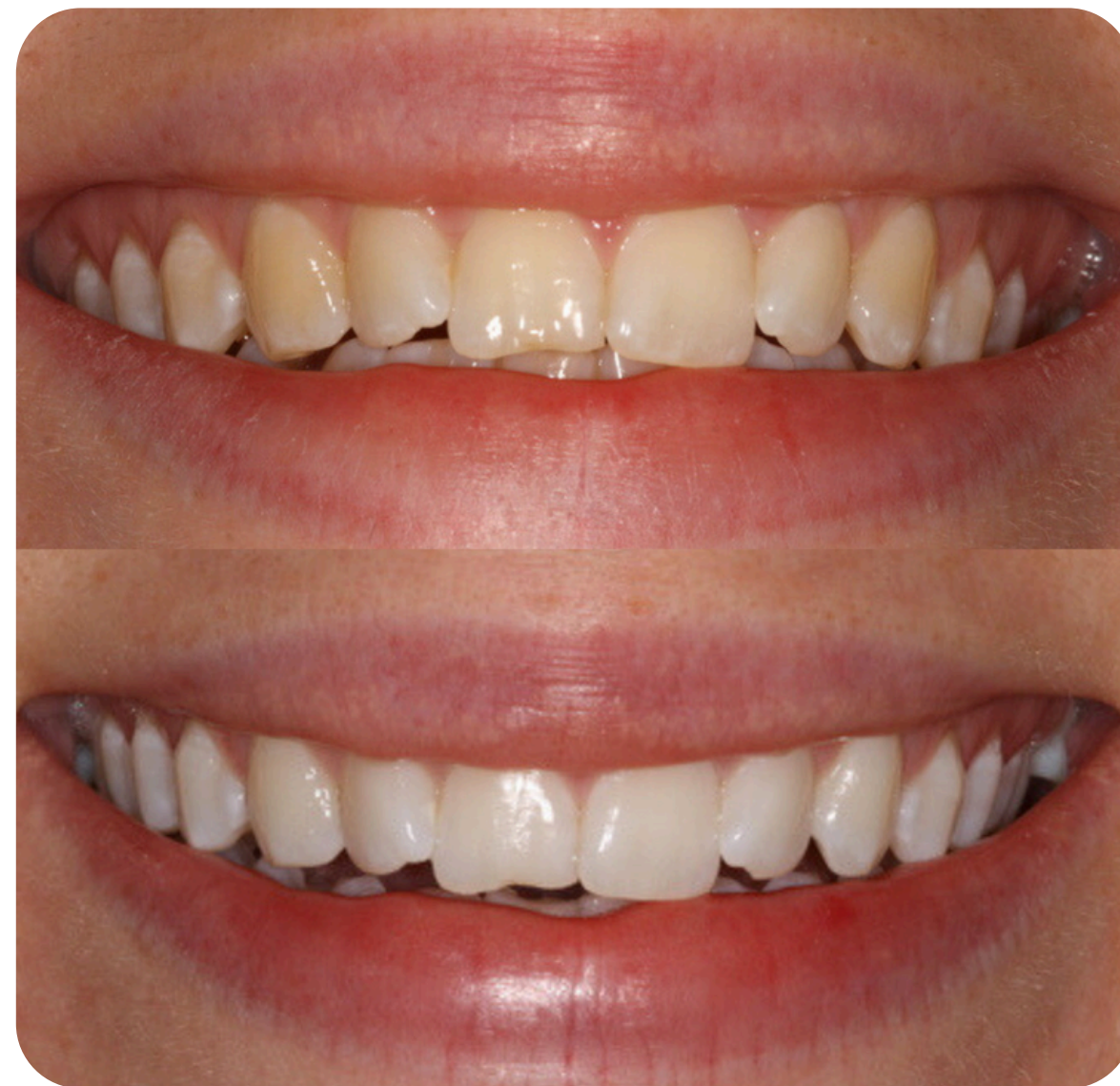
Achieved with: Whitening