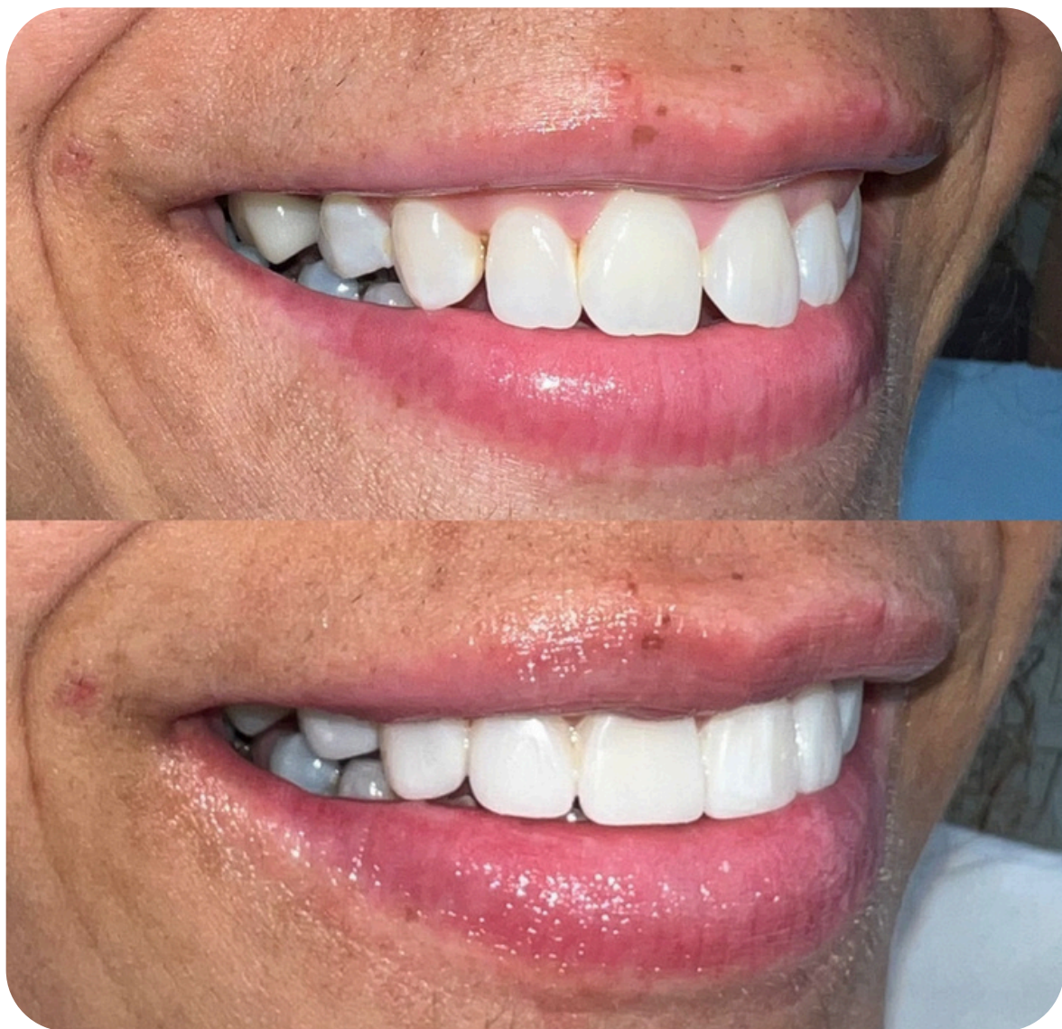
Achieved with: Composite Bonding