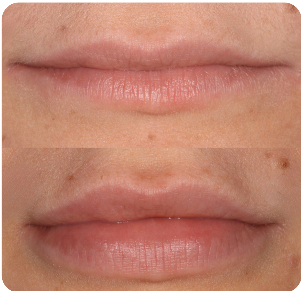
Achieved with: Lip Fillers