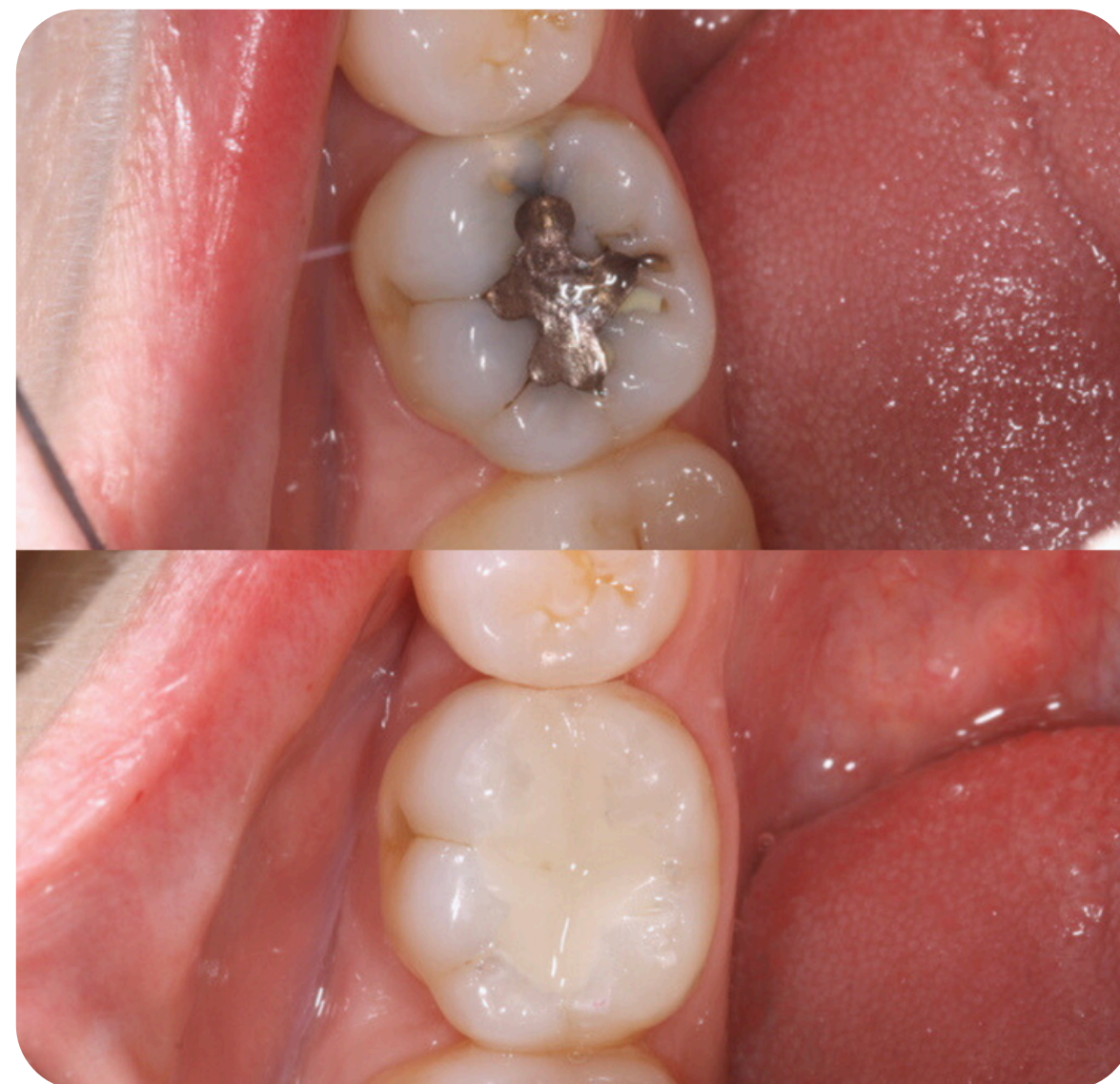
Achieved with: Composite Filling