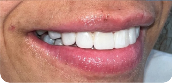
Achieved with: Composite Bonding