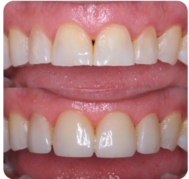
Achieved with: Veneers