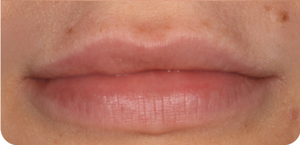
Achieved with: Lip Fillers