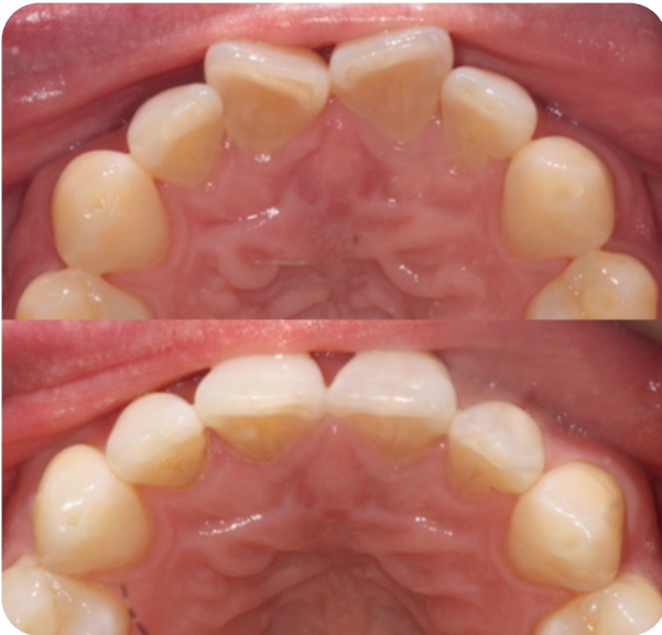
Achieved with: Invisalign