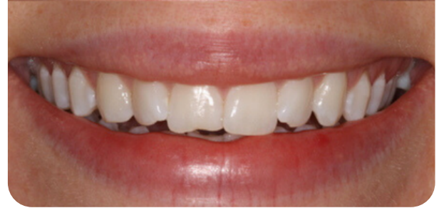
Achieved with: Whitening