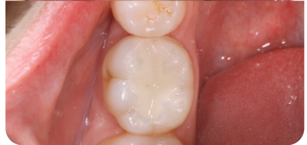
Achieved with: Composite Filling