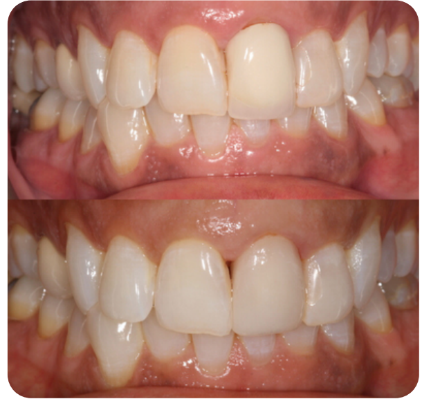
Achieved with: Crowns

From brighter smiles to straighter teeth, these before-and-after photos show the real results of our treatments. Every smile is unique, and we tailor our care to help you achieve the best possible outcome.